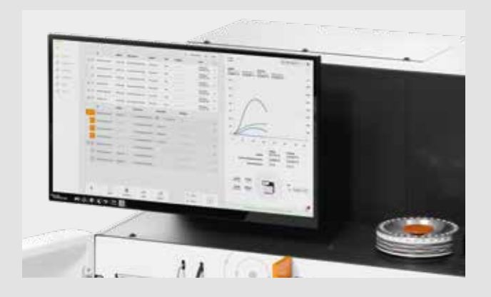
Ergonomic design with integrated PC and tiltable touchscreen